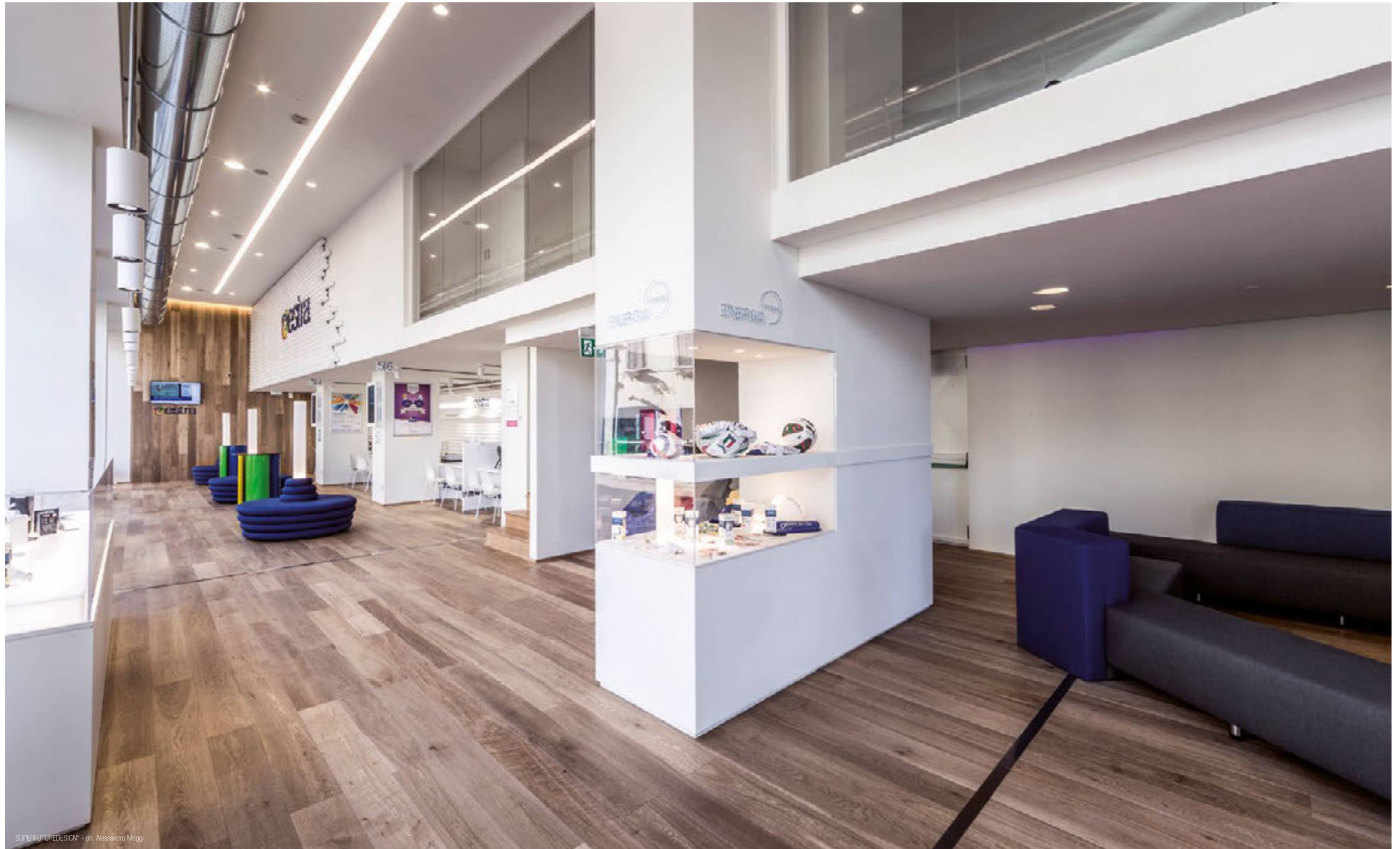
SUPERFUTUREDESIGN®