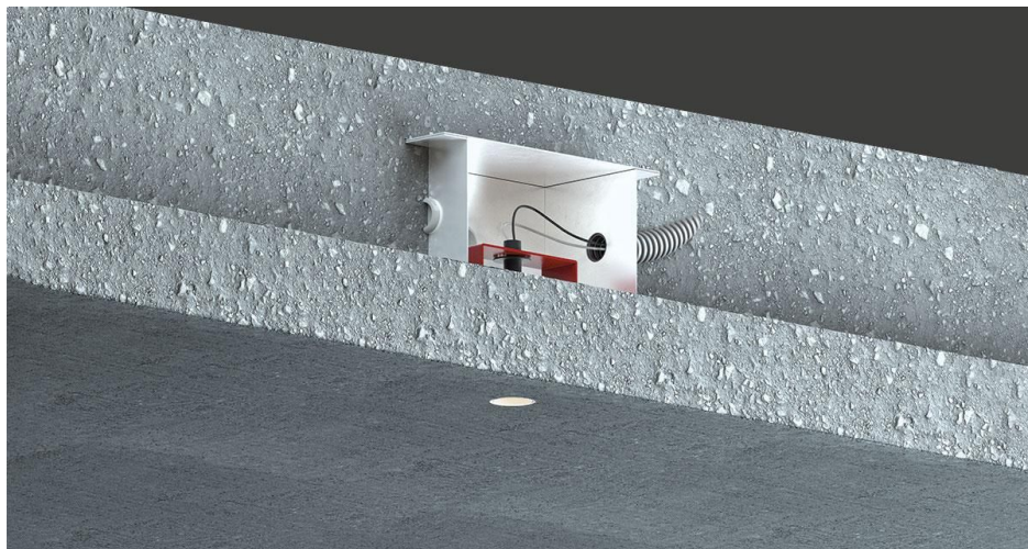
Genius Concrete Recessed by Buzzi & Buzzi.