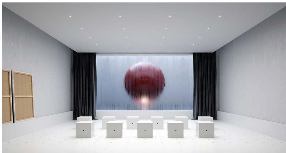
Genius Collection by Buzzi & Buzzi.

Available in a range of options including waterproof, low recess, directional and a 'naked', designed specifically for timber-lined ceilings. The light is so small and discreet that it essentially disappears on a ceiling.