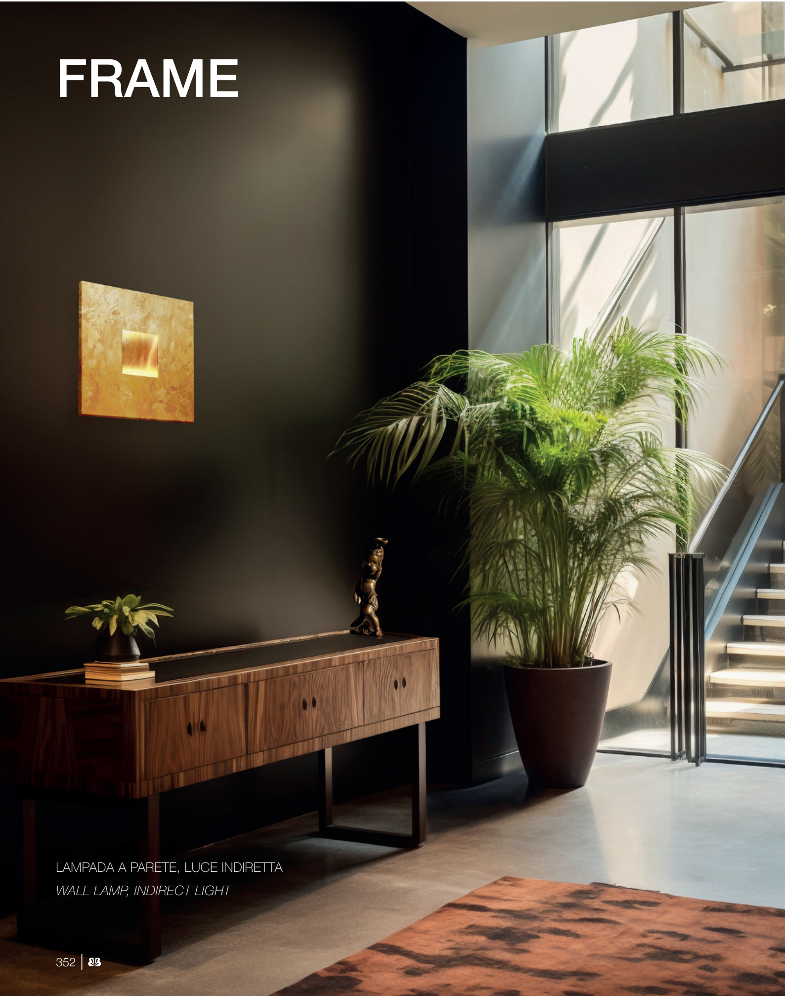
LAMPADA A PARETE, LUCE INDIRETTA WALL LAMP, INDIRECT LIGHT