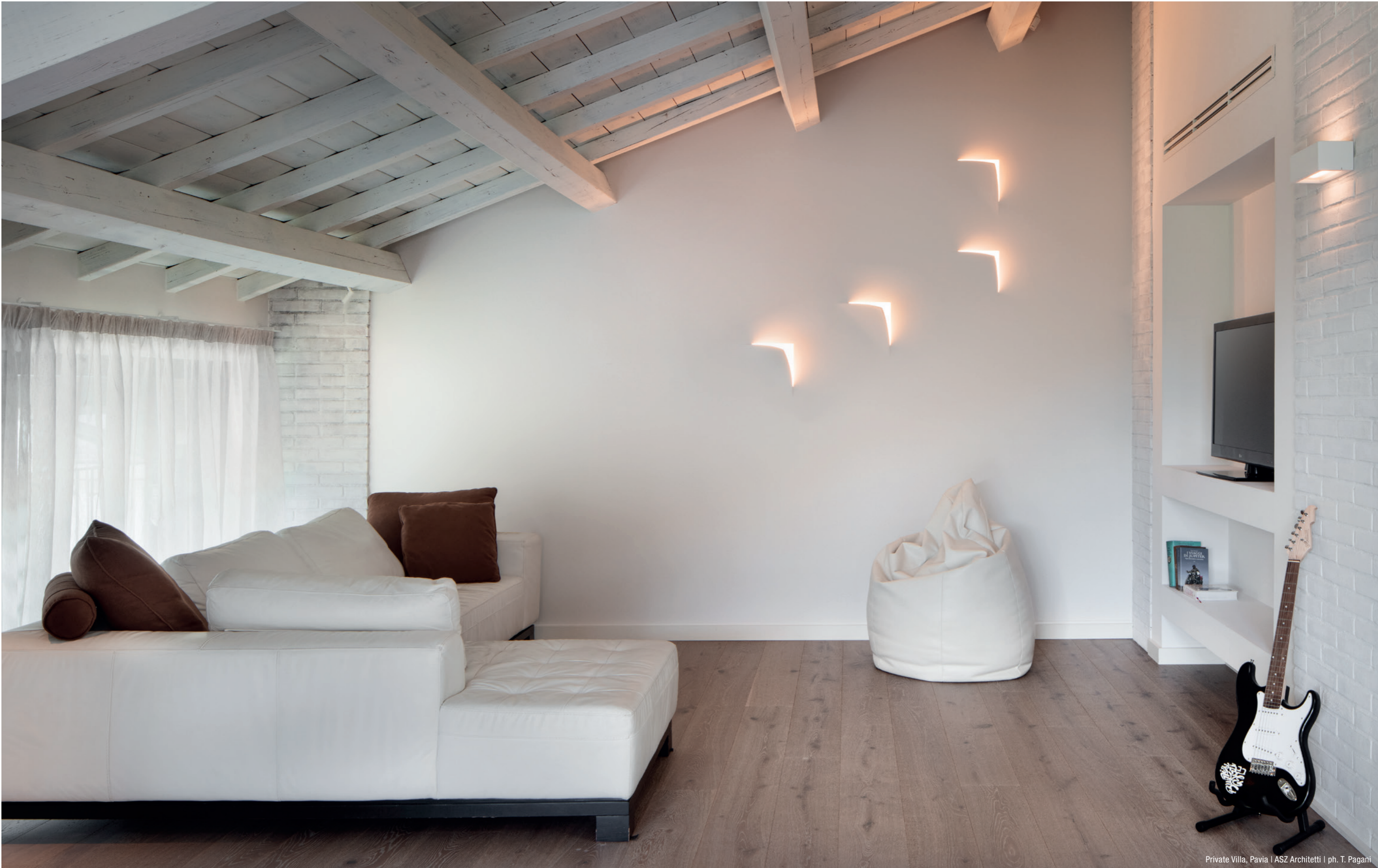
Private Villa, Pavia | ASZ Architetti