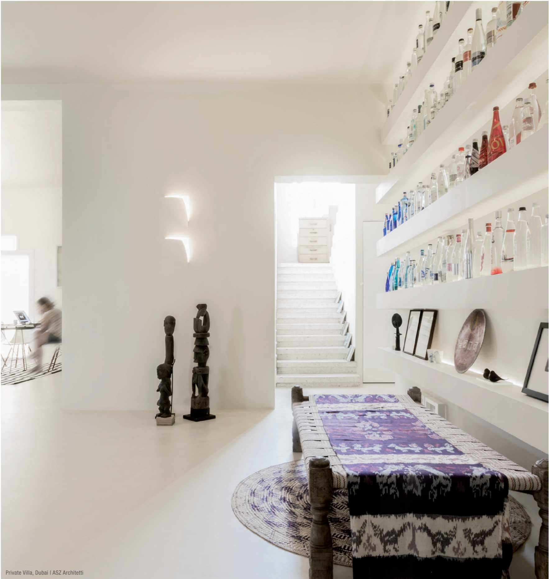
Private Villa, Dubai | ASZ Architetti