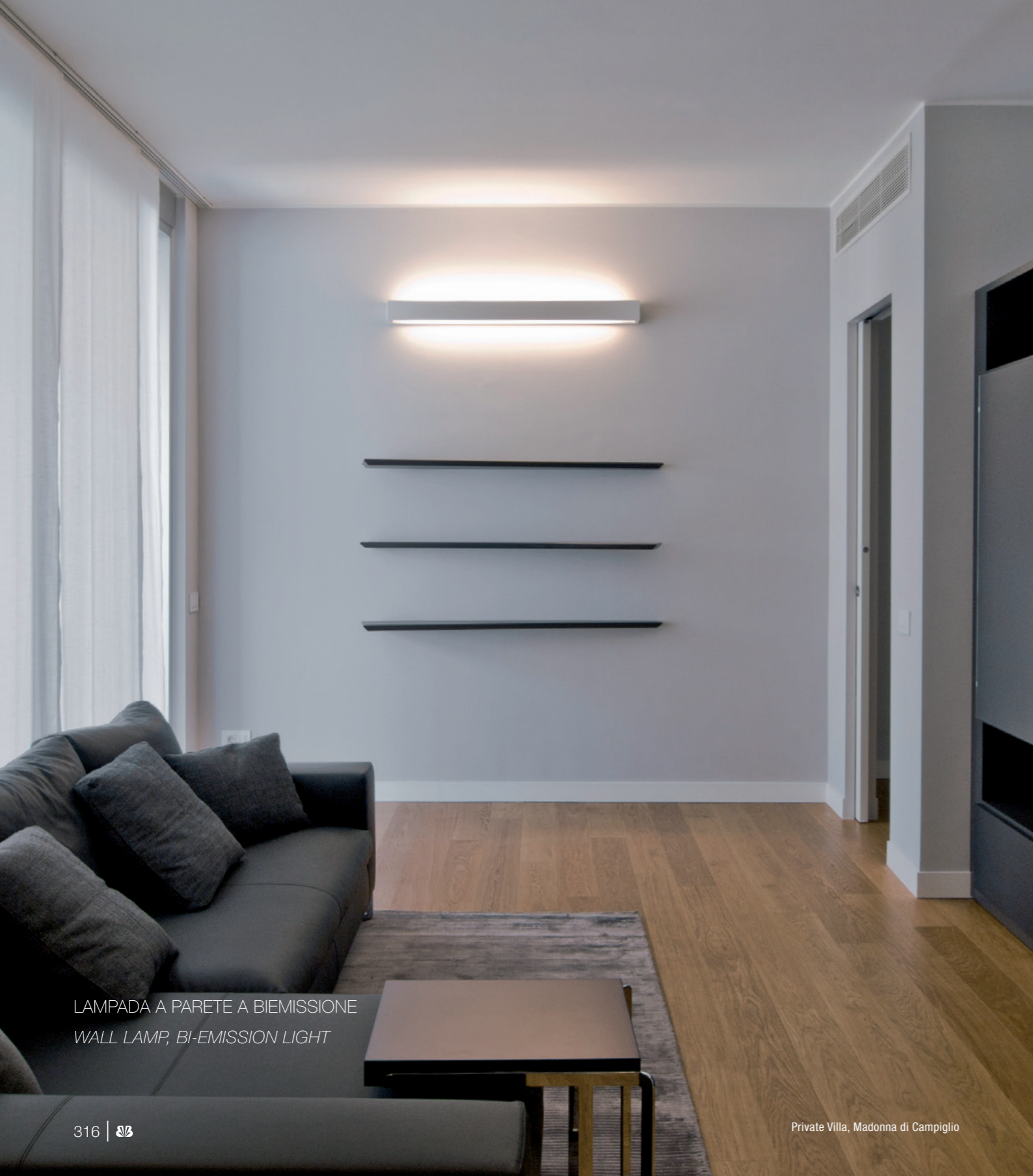
LAMPADA A PARETE A BIEMISSIONE WALL LAMP, BI-EMISSION LIGHT