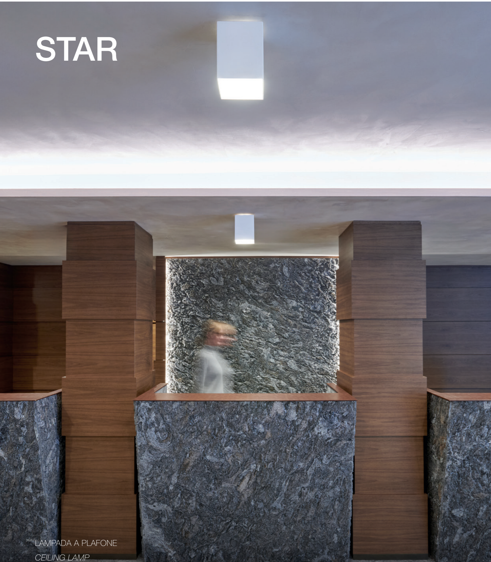
LAMPADA A PLAFONE CEILING LAMP