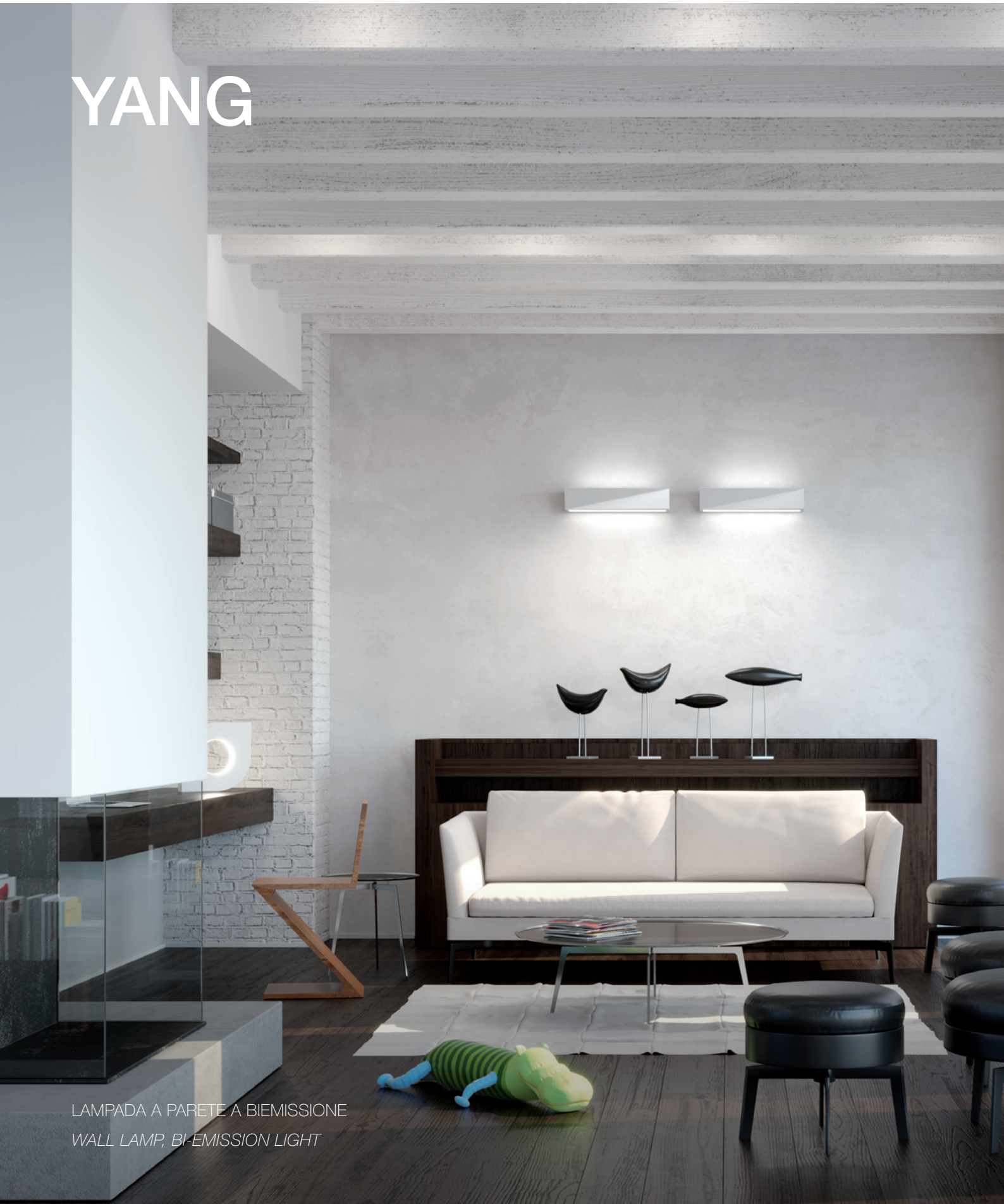
LAMPADA A PARETE A BIEMISSIONE WALL LAMP, BI-EMISSION LIGHT