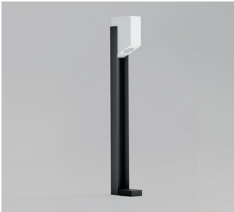
The Bollard IP65