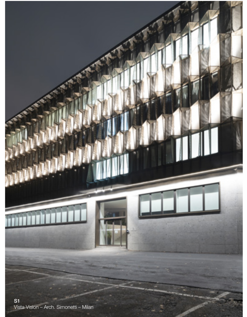
S1 Vista Vision - Arch. Simonetti - Milan