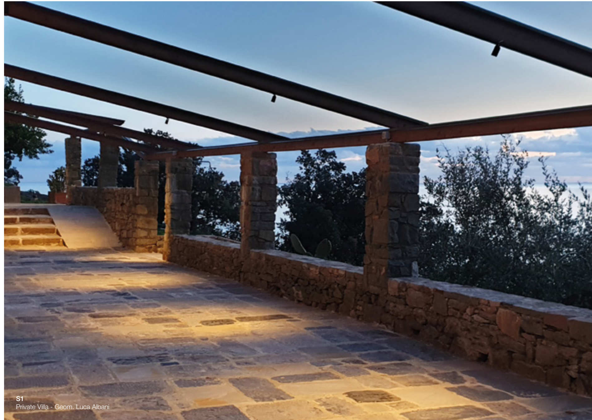
S1 Private Villa - Geom. Luca Albani