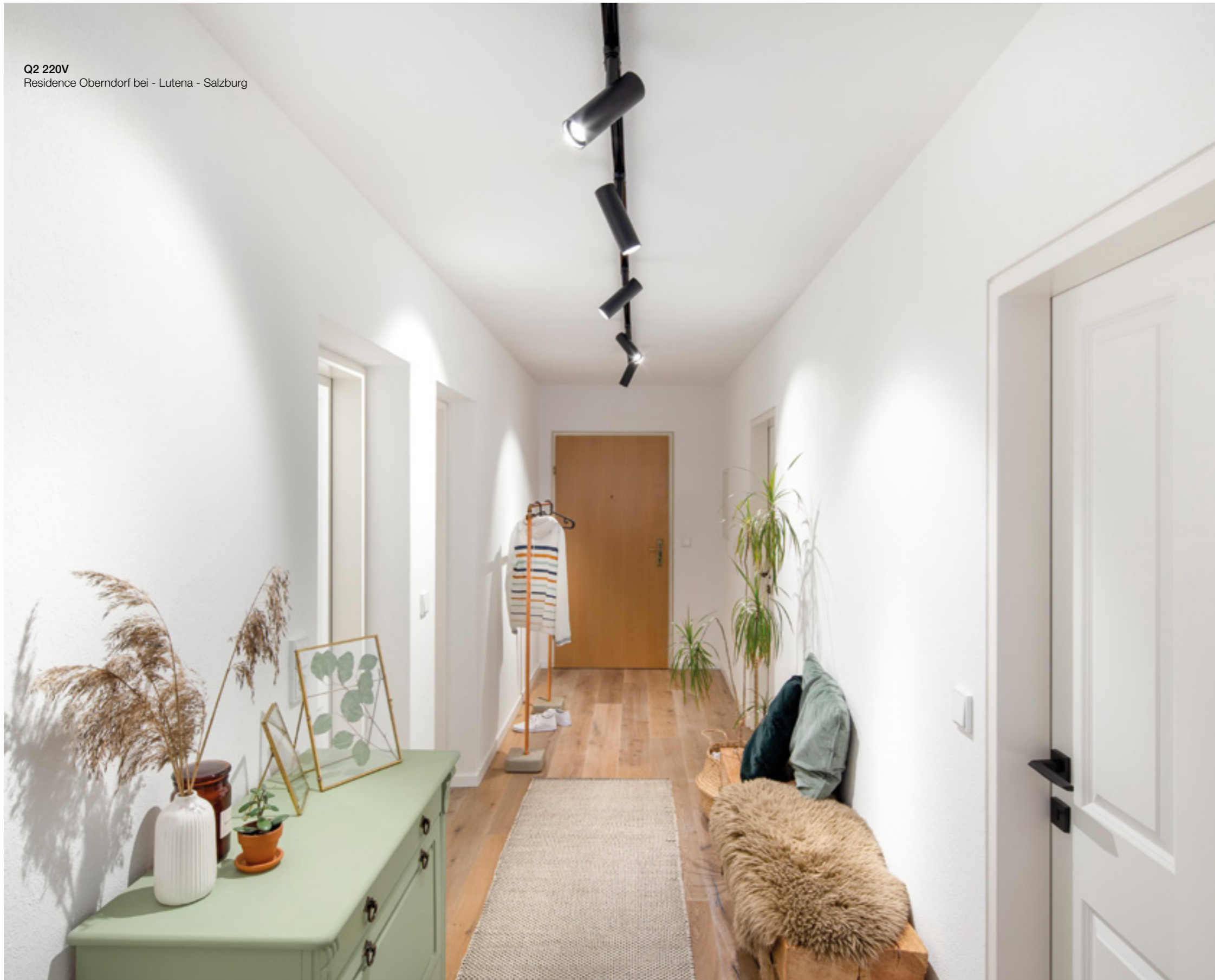
Q2 220V Residence Oberndorf bei - Lutena - Salzburg