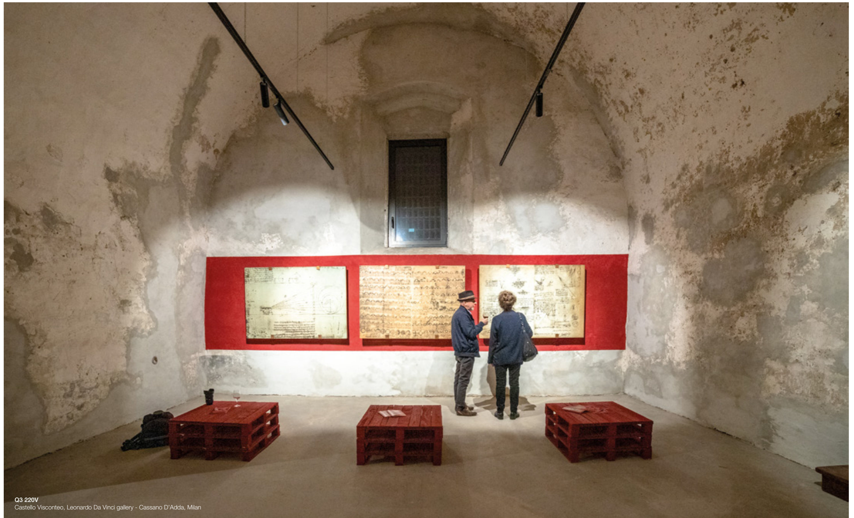
Q3 220V Castello Visconteo, Leonardo Da Vinci gallery - Cassano D'Adda, Milan