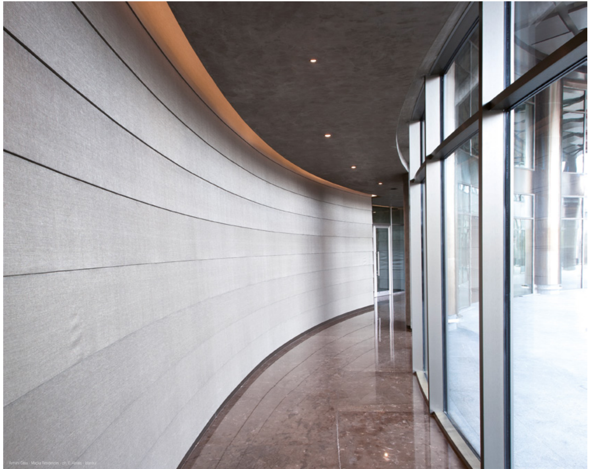
Armani Casa - Maçka Residences - Istanbul