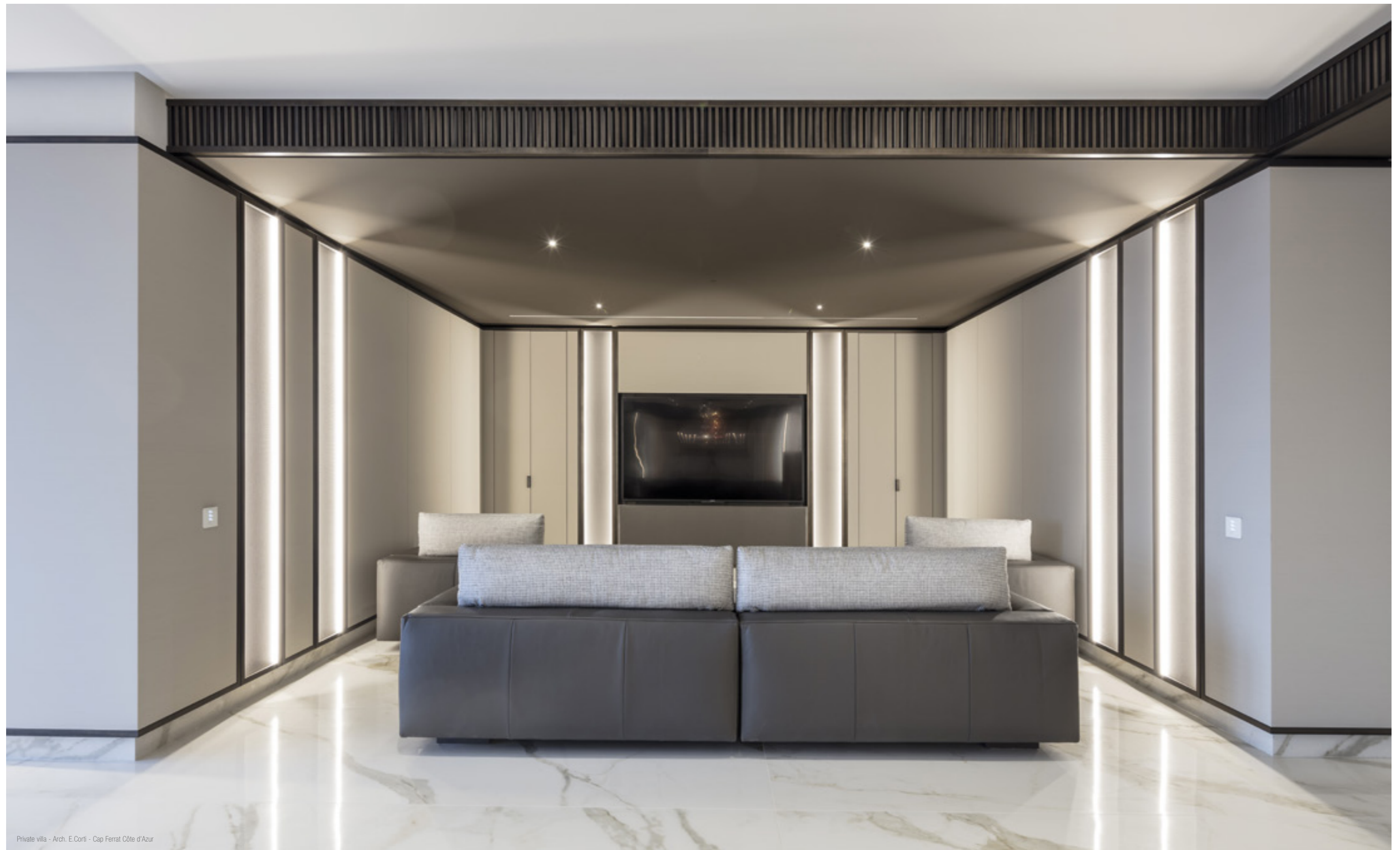
Private villa - Arch. E.Corti - Cap Ferrat Côte d'Azur