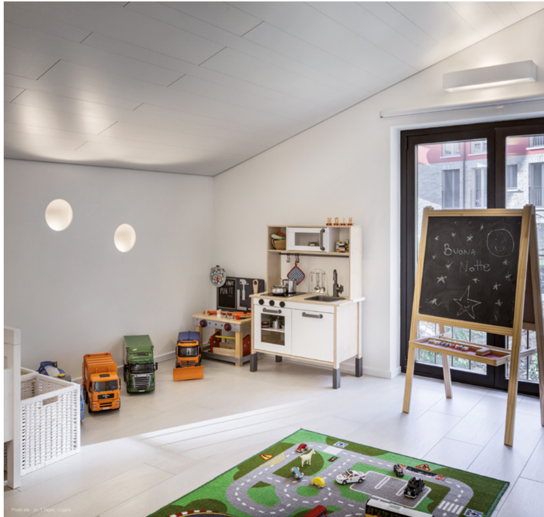
Private villa - Lugano