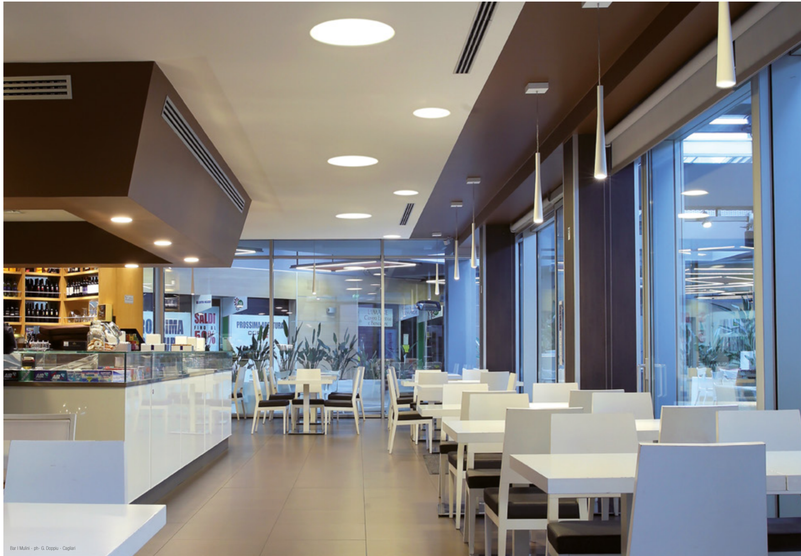
Bar I Mulini - - Cagliari