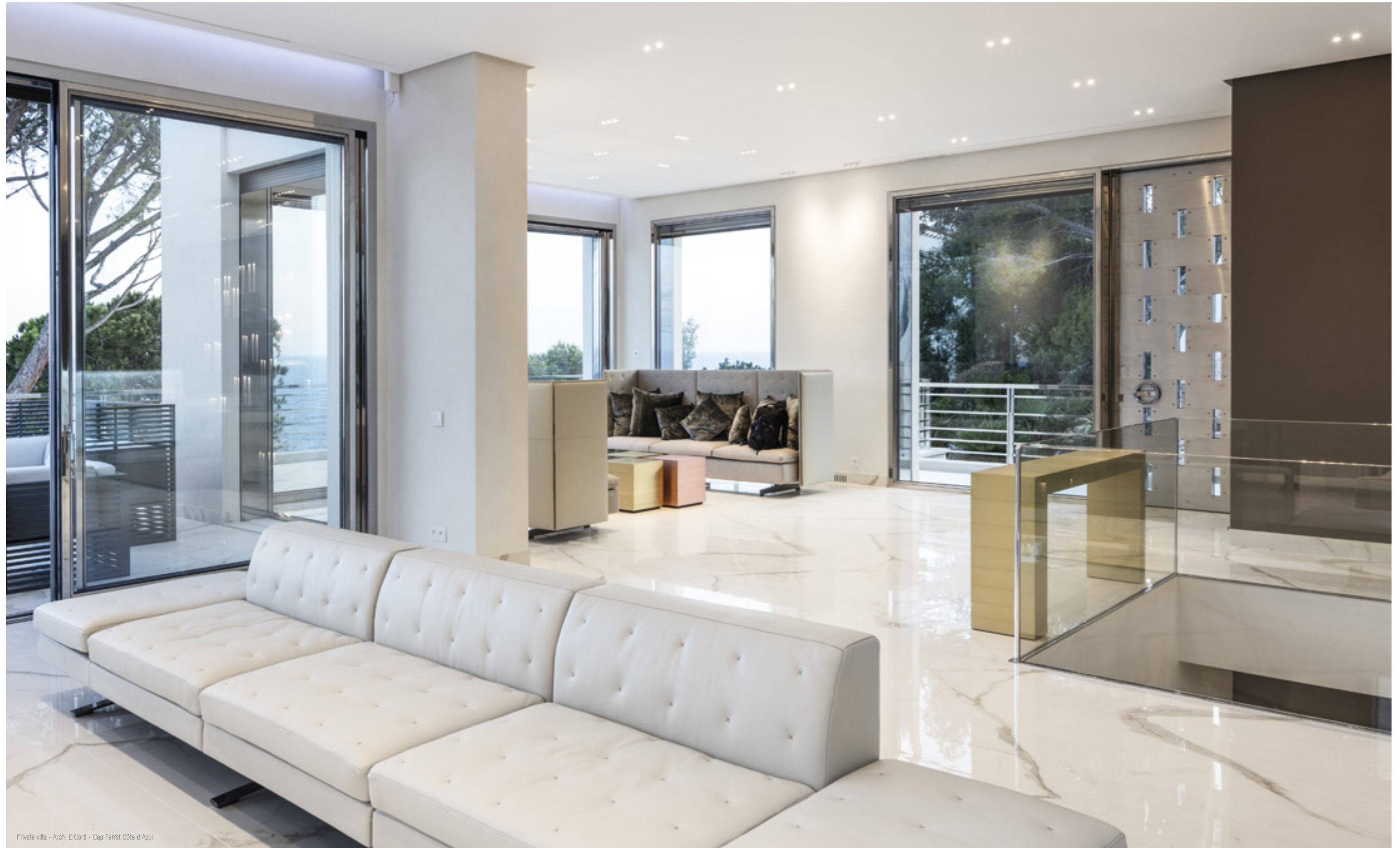
Private villa - Arch. E.Corti - Cap Ferrat Côte d'Azur